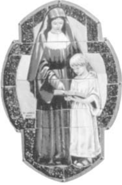
St. Angela Merici Pray for Us