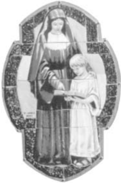
St. Angela Merici Pray for Us