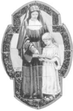
St. Angela Merici Pray for Us