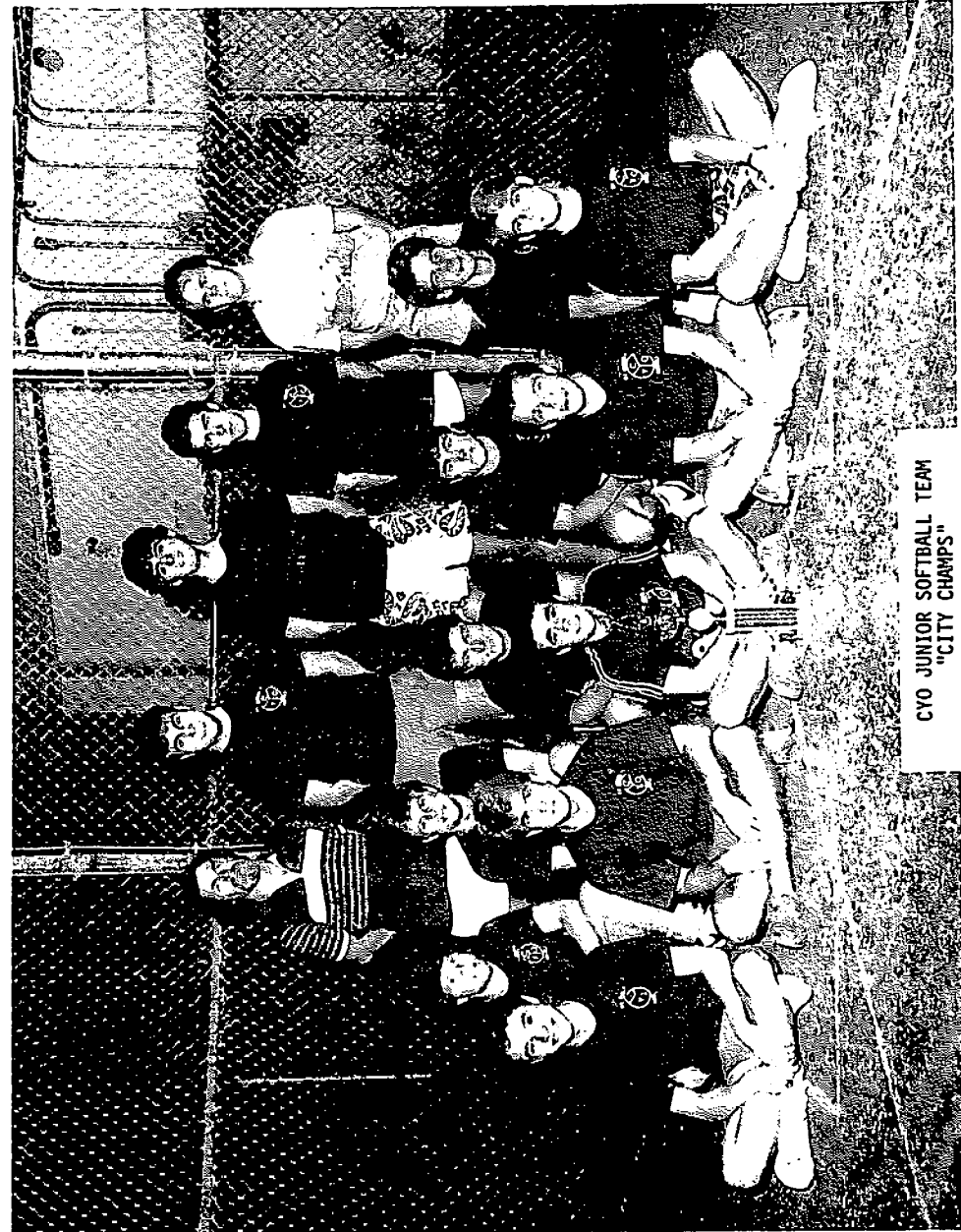
CYO JUNIOR SOFTBALL TEAM "CITY CHAMPS"