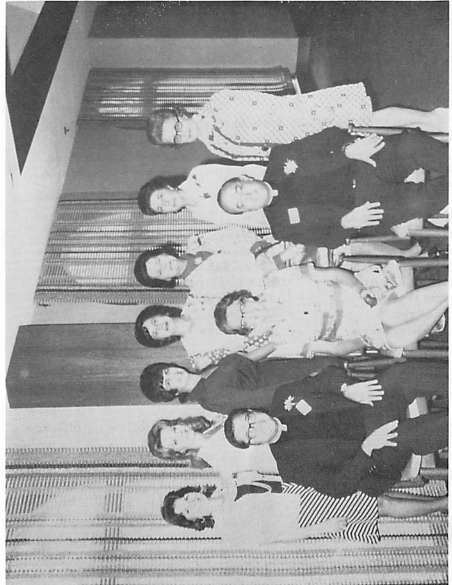
SALA OFFICERS - 1974-75

Arrangements should be made prior to Baptism. Mother & Father should contact the rectory to speak to one of the priest.