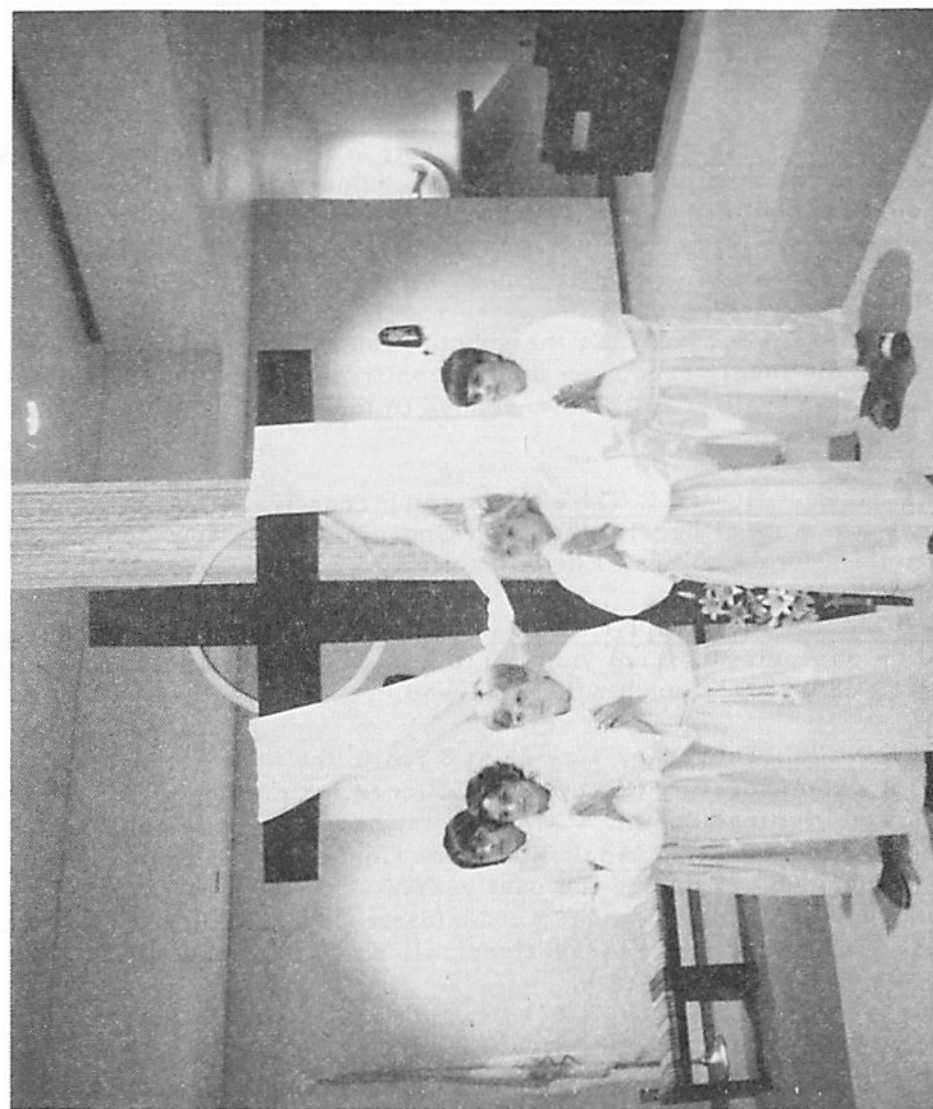
ALTAR BOYS IN THEIR NEW ROBES

Second Class Postage Paid at Metairie, La. 70002