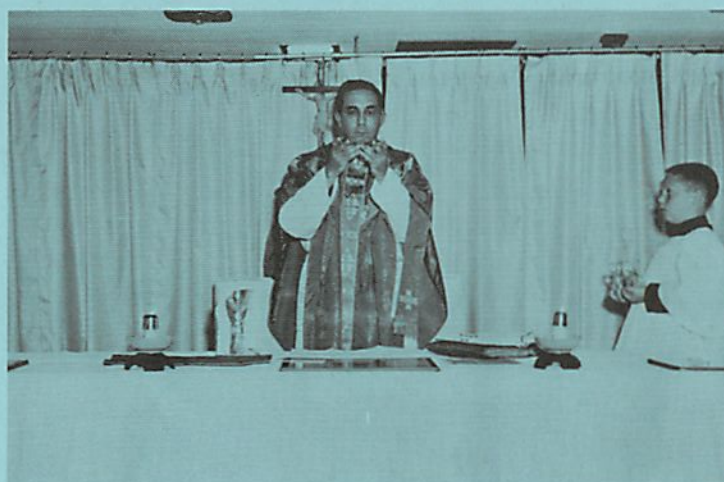
...now the new liturgy